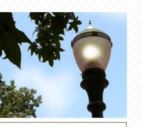
INSIGHTS Unique perspectives to drive success during healthcare's evolution