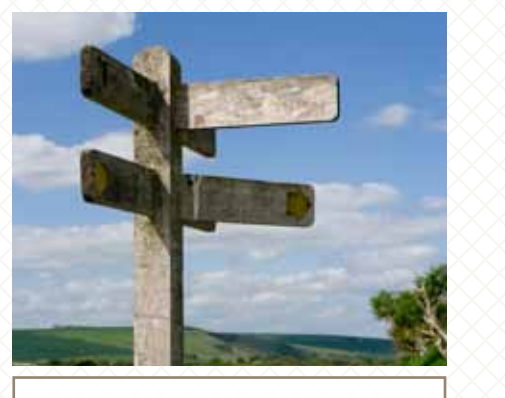
GUIDANCE Trusted thought leadership from healthcare-dedicated professionals